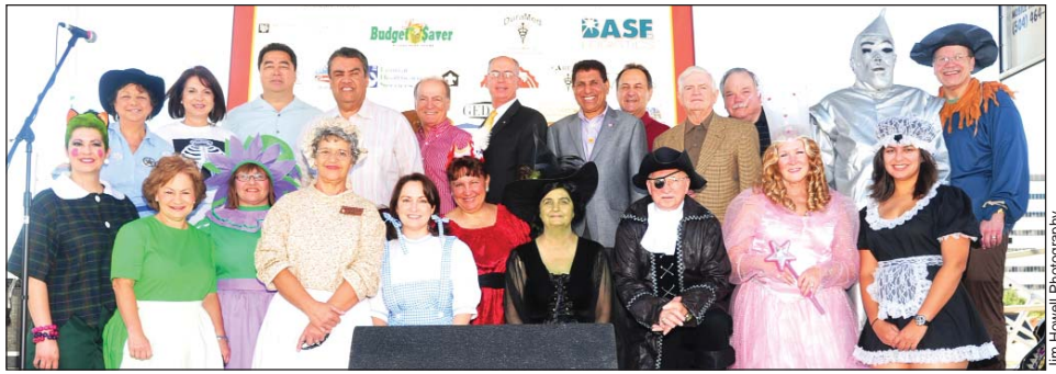
Costumed Officials and Volunteers Gather for Festival Opening!