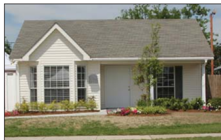
WJMC Care House

Conveniently located near West Jefferson Medical Center, the Care House is a complimentary service for families whose loved ones are being treated in critical care units at West Jefferson.