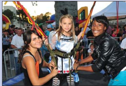
Kid Zone, Fun For All