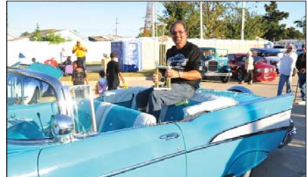
Car Show "Best of Show"