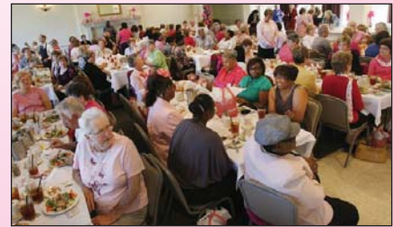
2010 Pink Tea