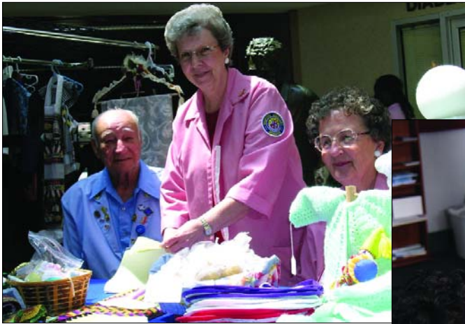
Using My Talents and Helping Others