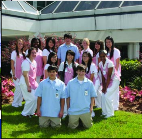
Where New Friends Are Made